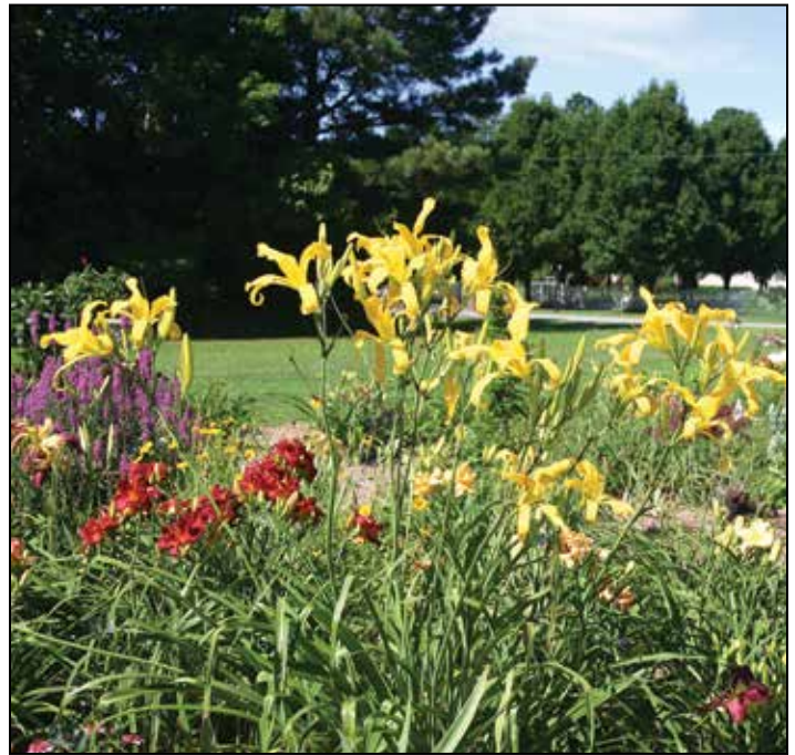
The visual centerpiece for the Region 14 display bed turned out to be Terah George's H. 'Banana Smoothie' (2006). Its imposing height at 64" certainly caught the attention of garden visitors.

several of the prominent hybridizers in our region actively hybridizing at present. Two cultivars, in particular, stood out. H. 'Double Blue Blood' (George-T. 2005), a 99% double tetraploid 5.5" blood red self, displayed a large number of blooms, and was one of the runners-up for the Georgia Doubles Appreciation Award. It is registered at 26" tall. On the other hand, 'Banana Smoothie' (George-T. 2006), a 64" tall, unusual form crispate tetraploid, sported its 10" yellow blooms against the brilliant blue sky. So commanding was this giant, that it garnered the Ned Roberts Spider/Unusual Form Award. Needless to say, I spent a lot of time enjoying how well the daylilies from Region 14 were flourishing.