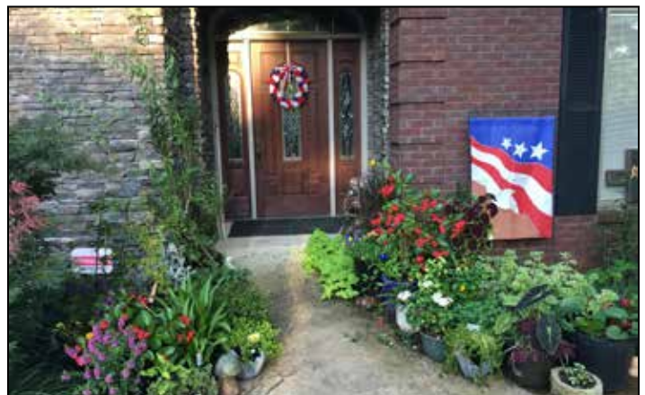
Picnic Hill is a lovely country home set just off Woodley Road, several miles south of Montgomery. Terese is a Master Gardener and fills her garden with a wide variety of plants, accentuating daylilies in late May and June.