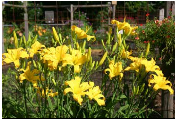
H. 'Tidewater Elf' (Holmes-S. 2012)

A special treat was the discovery of a single bloom of Pat Cochenour's H. 'Octomom' in the side yard leading to the back. The sun had come out, so I kept running back to catch it under a cloud. Finally I succeeded. More than one person kindly offered to stand in as a shadow, but I've found that for good photography, one needs natural light. Even a white umbrella tends to make the lighting a bit gray. 'Octomom' is typical of a newly emergent class of polymerous daylilies which bloom with more than the standard six segments. According to its registration data, this 6.5" lavender cream bicolor with a dark lavender eye blooms with eight segments 45% of the time. One will also notice the eight corresponding anthers.