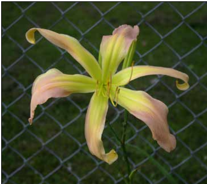
H. 'Wanda Evans' (Holmes-S. 2009)

The fifth garden on our tour was Feistel's Folly, the garden of Greg and Dianna Feistel. This young couple had graciously offered to host regional beds for all of the fifteen Regions in AHS. A large portion of an entire lawn had been set aside to accommodate these beds. About 200 cultivars sent by Regions 1, 2, 3, 4, 5, 8, 10, 11, 13, 14, and 15 were superbly grown. Each Region approached the offer differently. Region 13, for example, sent their Stout Medal winners and daylilies that historically have done well in their region, while Region 2 sent newer cultivars from many of their hybridizers. Region 14 chose to send cultivars largely