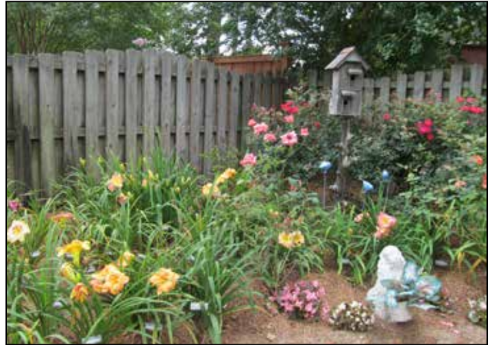
The expansive backyard garden at the Fries contains literally hundreds of daylilies as well as birdbaths, rustic bird houses, and some unique garden art, complemented by numerous companion plants.