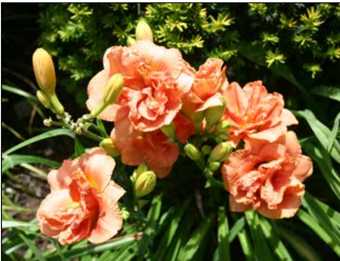
H. 'Micro Dots' (Trimmer-J. 2003)

Two of these doubles were H. 'Micro Dots' (Trimmer-J. 2003), a 2.87" miniature cantaloupe diploid (blooms are much smaller than the close-up implies), and 'Moses' Fire' (Joiner 1998), a 6" red tetraploid.