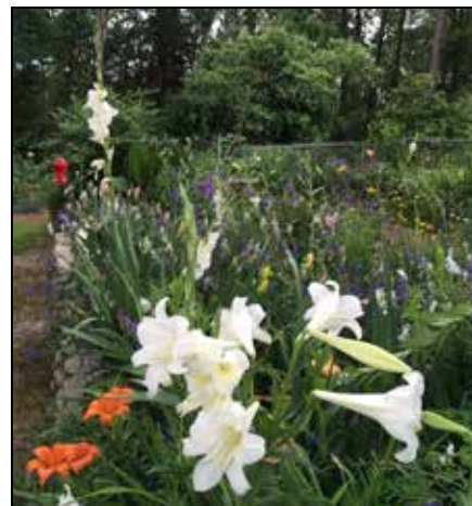
Rita Moore’s Garden with Easter lilies and other early spring flowers

Hope you will consider showing with us. Just have your entries there by 8:00 A.M. for a fun filled day.