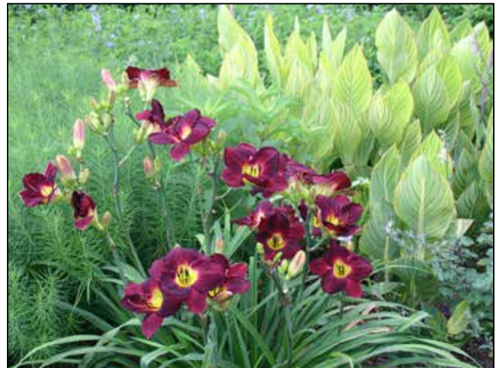
H. 'Goodnight Lucy' (Bunting 2009)

Two of the prettiest individual blooms I photographed were by Region 3 hybridizers: H. 'Dapper Flapper' (Burkey 2003) and 'Jellyfish Jealousy' (Reed 1995). Clayton Burkey's bright golden yellow cultivar is registered