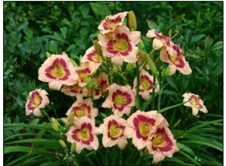
H. 'Wineberry Candy' (Stamile 1990)

One of the pleasing things about visiting a good botanical garden, is that you get to reacquaint yourself with old friends—daylilies that is. If you attend a National Convention, you also renew your human friendships as well.