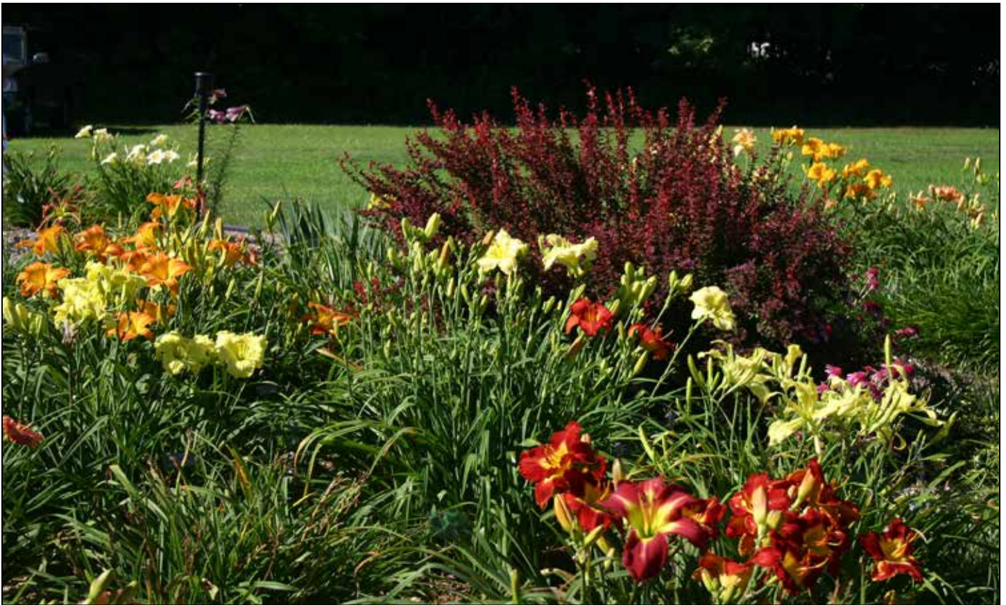
In front of Greg and Dianna Feistel's home stretches an expansive green lawn. Large beds like the one pictured contained a mixture of daylilies amid an assortment of companion plants.