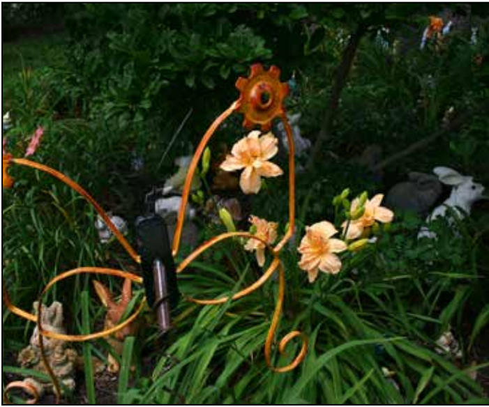
H. 'Scatterbrain' (Joiner 1988), a light peach pink diploid double, was blooming in the midst of what appeared to be some sort of rustic insect surrounded by bunnies too numerous to count.

than I had imagined. I would say it was about 3.5" in bloom size, although no size is generally listed for daylilies on the AHS website prior to 1963.