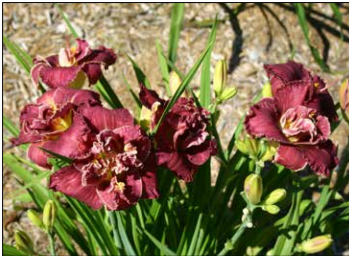
H. 'Nehi Grape' (Stadler 2015)