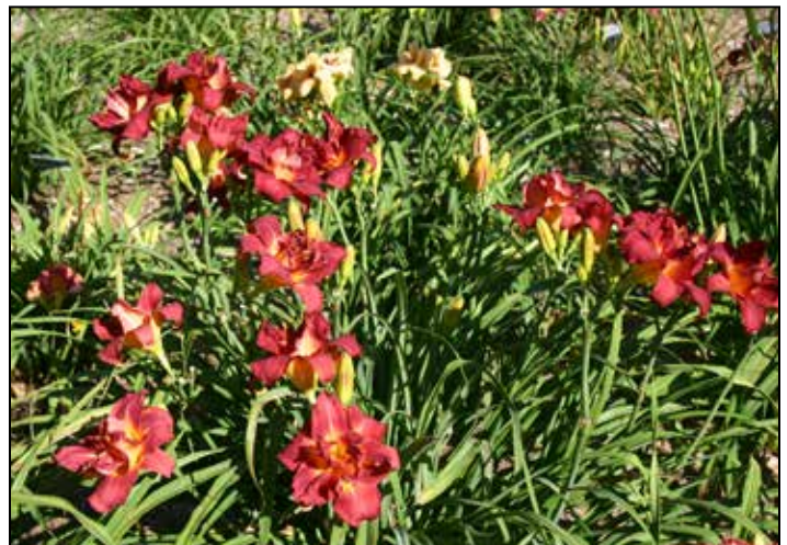
H. 'Double Blue Blood' (George-T. 2005)

The fifth garden on our tour was Feistel's Folly, the garden of Greg and Dianna Feistel. This young couple had graciously offered to host regional beds for all of the fifteen Regions in AHS. A large portion of an entire lawn had been set aside to accommodate these beds. About 200 cultivars sent by Regions 1, 2, 3, 4, 5, 8, 10, 11, 13, 14, and 15 were superbly grown. Each Region approached the offer differently. Region 13, for example, sent their Stout Medal winners and daylilies that historically have done well in their region, while Region 2 sent newer cultivars from many of their hybridizers. Region 14 chose to send cultivars largely