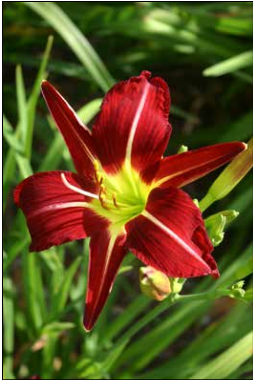
H. 'July Four' (Wynne)

several of the prominent hybridizers in our region actively hybridizing at present. Two cultivars, in particular, stood out. H. 'Double Blue Blood' (George-T. 2005), a 99% double tetraploid 5.5" blood red self, displayed a large number of blooms, and was one of the runners-up for the Georgia Doubles Appreciation Award. It is registered at 26" tall. On the other hand, 'Banana Smoothie' (George-T. 2006), a 64" tall, unusual form crispate tetraploid, sported its 10" yellow blooms against the brilliant blue sky. So commanding was this giant, that it garnered the Ned Roberts Spider/Unusual Form Award. Needless to say, I spent a lot of time enjoying how well the daylilies from Region 14 were flourishing.