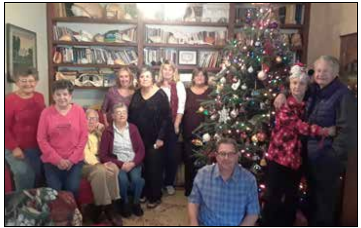
Group photo at club Christmas party