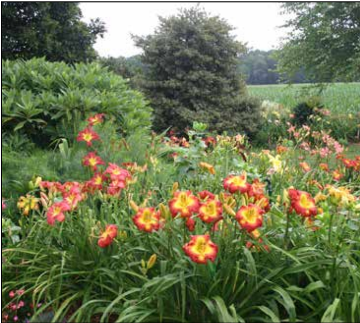
H. 'Annandale Plantation' (Douglas-C. 2013), a coral red diploid with white midribs, and 'Forever Redeemed' (Carpenter-J. 2003), a red tetraploid with large gold throat, make a striking combination.