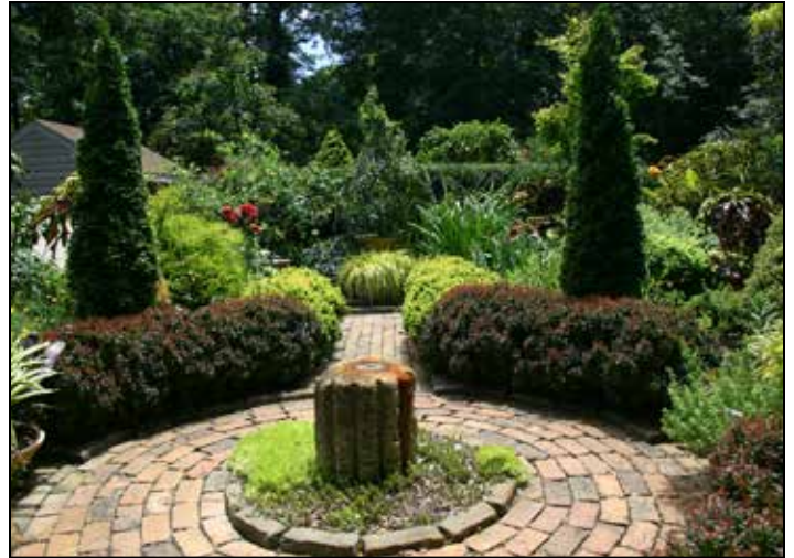
A circular brick walkway surrounds a columnar birdbath and continues on amidst shrubs in varying shades of purple and chartreuse.

Near the entrance to the Pinkham garden is a formal garden, the first of several garden rooms, featuring an exotic collection of shrubs, roses, grasses, and various other ornamental plants.