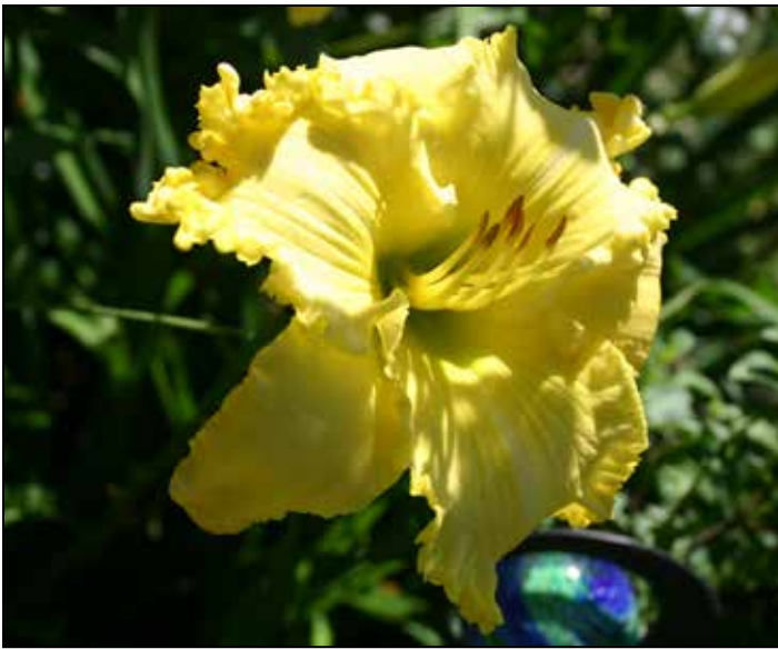
H. 'Spacecoast Irish Illumination' (Kinnebrew-J. 2008)