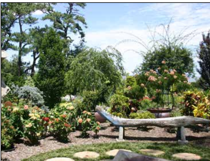
A sculpted crocodile with Crown of Thorns