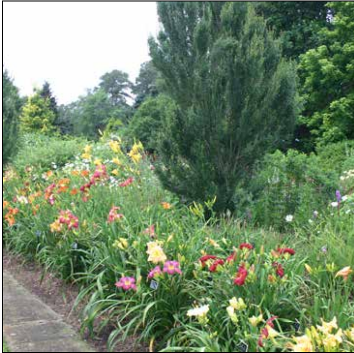
A portion of the Dan Tau Seedling Bed

Fortunately, despite a little misty rain now setting in, I had been able to get a few shots of some of the many clumps of daylilies, as well as some individual blooms, when I first arrived. So I was happy.