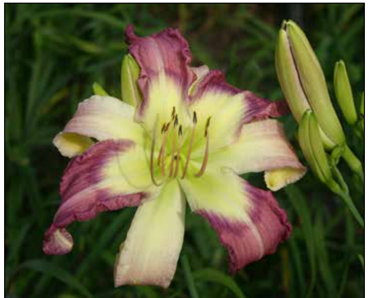
H. 'Octomom' (Cochenour 2009)

A special treat was the discovery of a single bloom of Pat Cochenour's H. 'Octomom' in the side yard leading to the back. The sun had come out, so I kept running back to catch it under a cloud. Finally I succeeded. More than one person kindly offered to stand in as a shadow, but I've found that for good photography, one needs natural light. Even a white umbrella tends to make the lighting a bit gray. 'Octomom' is typical of a newly emergent class of polymerous daylilies which bloom with more than the standard six segments. According to its registration data, this 6.5" lavender cream bicolor with a dark lavender eye blooms with eight segments 45% of the time. One will also notice the eight corresponding anthers.