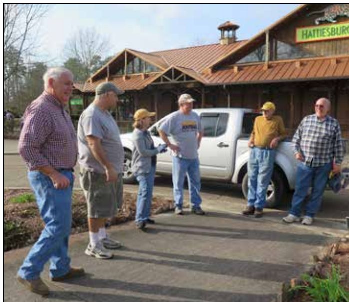
Working at the Hattiesburg Zoo