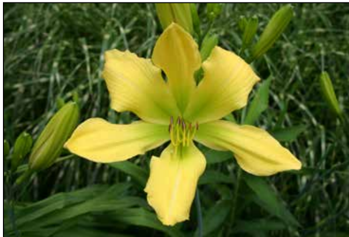
H. 'Dapper Flapper' (Burkey 2003)

as an unusual form spatulate. Margo Reed's 7" cream with a violet feathered eye is registered as an unusual form cascade. Its feathering appears to possess the lightest stippling effect.