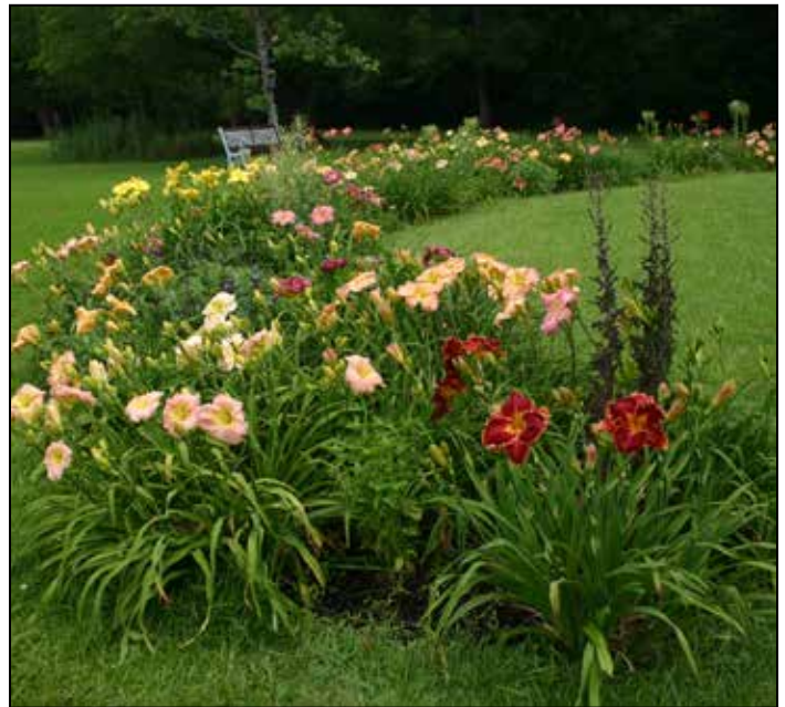
We try to grow many of our daylilies in clumps, as we feel they often make the best showing. In the foreground are H. ‘ Blazing Cannons ’ (Waldrop 2013) and ‘ Rachel Billingslea ’ (Billingslea 1990). Whenever possible, we incorporate companion plants, such as the basil and red lettuce featured above.