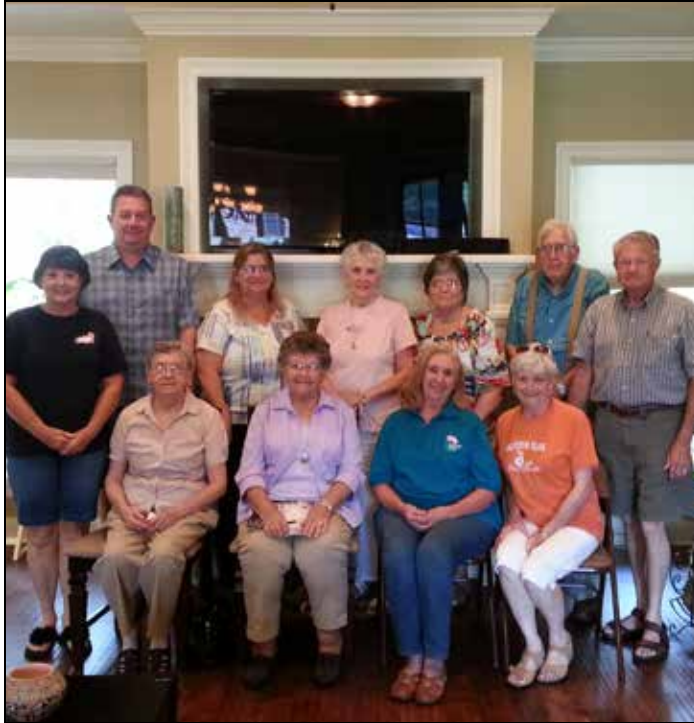
Group photo at the Meridian Daylily Club's barbecue in July