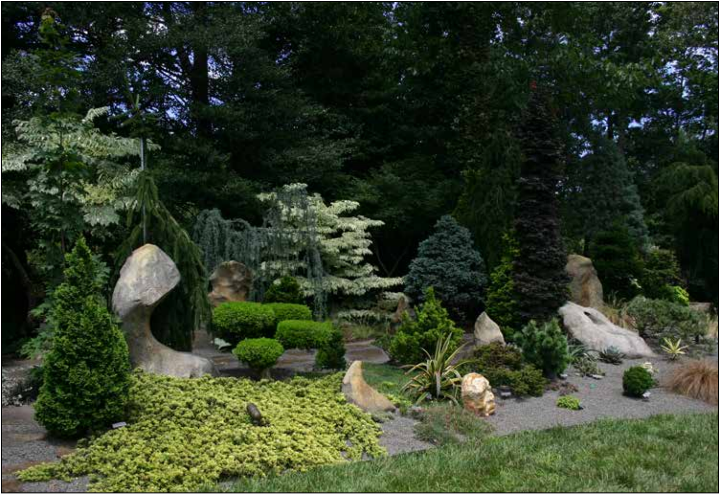
The excellence of design in this Asian venue

As one turns and looks back across the grassy lawn which borders the Asian venue, one sees a beautiful planting of double daylilies set amid what appears to be an almost tropical setting.