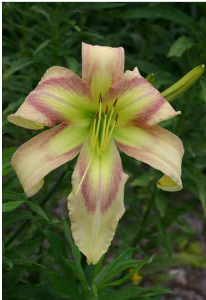
H. 'Jellyfish Jealousy' (Reed 1995)

In many ways, I think the Norfolk Botanical Garden indeed rivals some of the more prominent botanical gardens located throughout the United States.