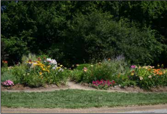
Lissa Cash’s front yard