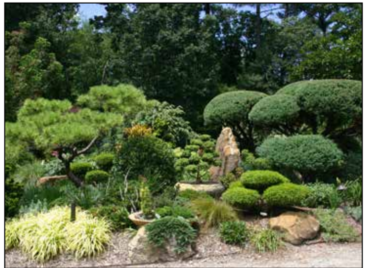
An Asian-like area in the Pinkham garden

Directly across the driveway is another garden room, featuring an impressive display of bonsai-like plants, stones, and grasses typical of an Asian venue.