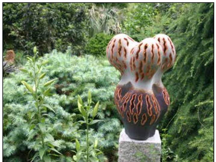
A beautiful artifact