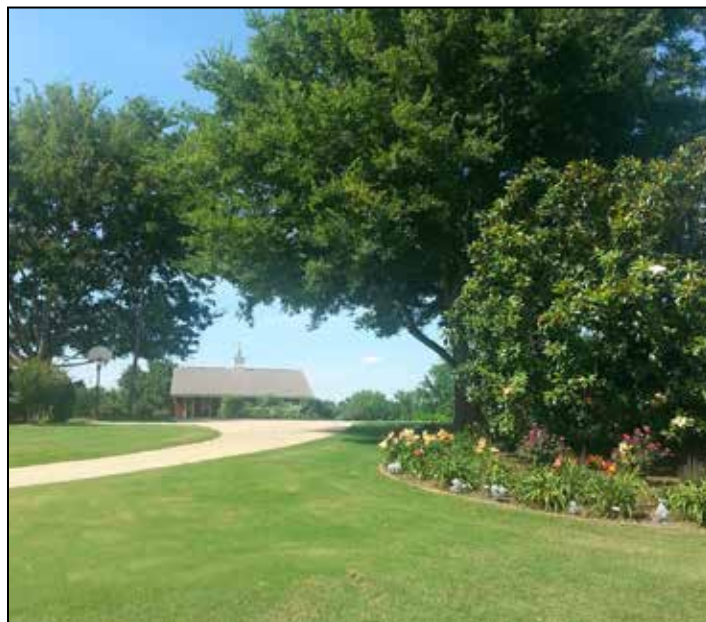
A curving driveway leads past one of many daylily beds at Otis Acres. In the distance is a working "barn" which houses garden equipment; to its right is the Sally Lake Memorial Bed.