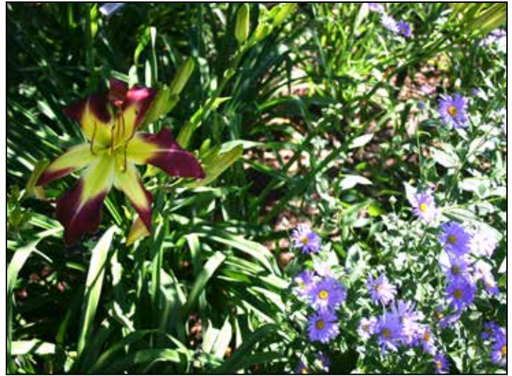
H. ‘ Baughton Hornswaggler ’ (Holmes-S. 2008)

In Lissa’s wooded back yard, she had planted numerous shade plants along a small creek bed. Interspersed among these in spots of sunlight were more daylilies.