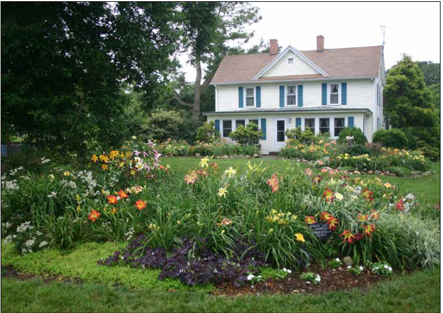
While the Sterrett garden is filled with ornamentals, perennials, annuals, and various bulbs to give color throughout the seasons, the emphasis is on daylilies. There is an AHS Display Garden, featuring daylilies of all sizes and form.