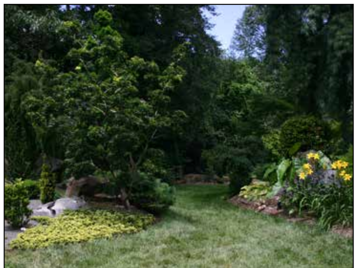
A grassy lawn between venues