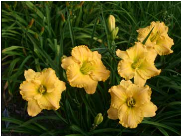
H. 'Empire Queen' (Carpenter-J. 2003)

The Sweetland garden's backyard was filled with daylilies, as well as other plants known to attract birds and insects. H. 'Empire Queen' (Carpenter-J. 2003), a 6" creamy gold tetraploid with light sculpting on its petals, made a nice clump.