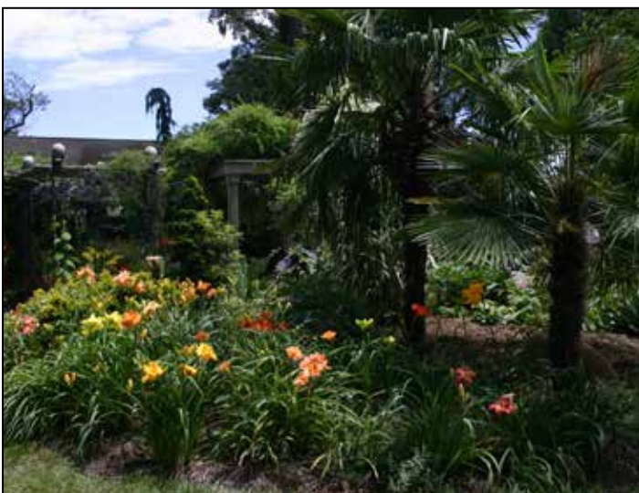
An almost tropical setting for double daylilies

Although I featured this photo on the back cover of the 2017 Spring/Fall issue of The Dixie Daylily , I wanted to include it here for others to see. I'm very proud I had the opportunity to take this photo, and for it I must express my thanks to the Pinkhams' impeccable artistry.